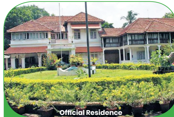
Official Residence Cliff House, Nanthancode